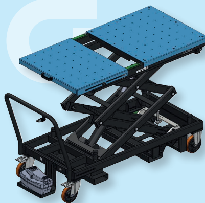
GO CODE 1500B 1 with 1 pcs. kg 405 kg