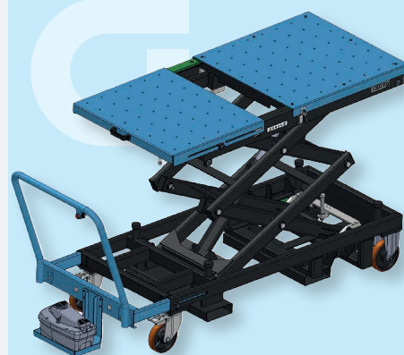
GO CODE 1500T 1 with 1 pcs. kg 430 kg